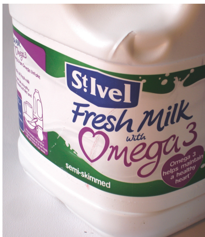
Milk is one of many food and beverage products which have been supplemented with omega-3 from fish oil

For example eicosanoids made from AA are highly inflammatory (a useful function on many occasions to help defend and repair the body), while eicosanoids made from EPA are much less so. The problem is that if almost all the eicosanoids are made from AA this makes the system highly reactive and on occasion over-reactive, resulting in un-wanted inflammation (as in coronary disease) and allergic responses such as asthma. It is therefore important to have a balance of the two types of eicosanoids (refs. 2 and 3). This explains why EPA is seen to have an anti-inflammatory effect particularly in cases of cardiovascular disease.