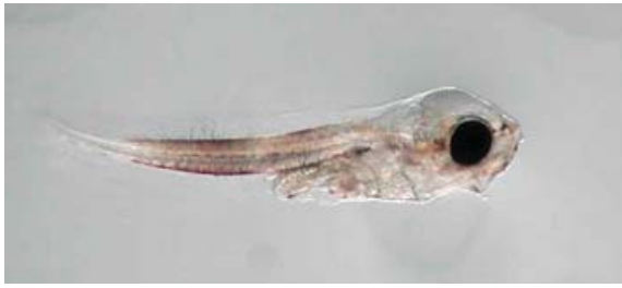
6 day old barramundi larvae